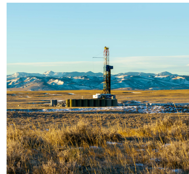
Drilling by Bright Rock Energy

As at June 30, 2024, the Deutsche Rohstoff Group consisted of the following material Group companies and equity investments. Subsidiaries and equity investments that are to be held permanently are considered material.