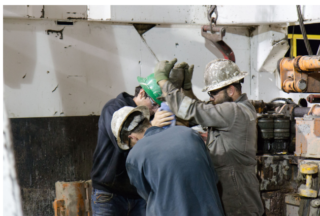
Drilling by 1876 Resources

Our balance sheet also continues to show a very robust development. Despite the high investments in the first half of the year, the equity ratio was 41.5% (31.12.2023: 38.0%). The increase is due to the good Group result, the stronger US-Dollar as well as repayments, which reduced liabilities by 15 million. Net debt rose to EUR 126.0 million (31.12.2023: EUR 79.1 million) as a result of these repayments, further investments